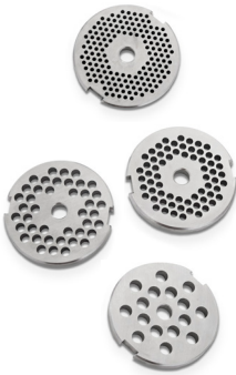
Stainless steel hole discs 2.5, 4.5, 6 and 8 mm.