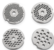
HOLE DISCS, 2,5 / 4,5 / 6 / 8 mm